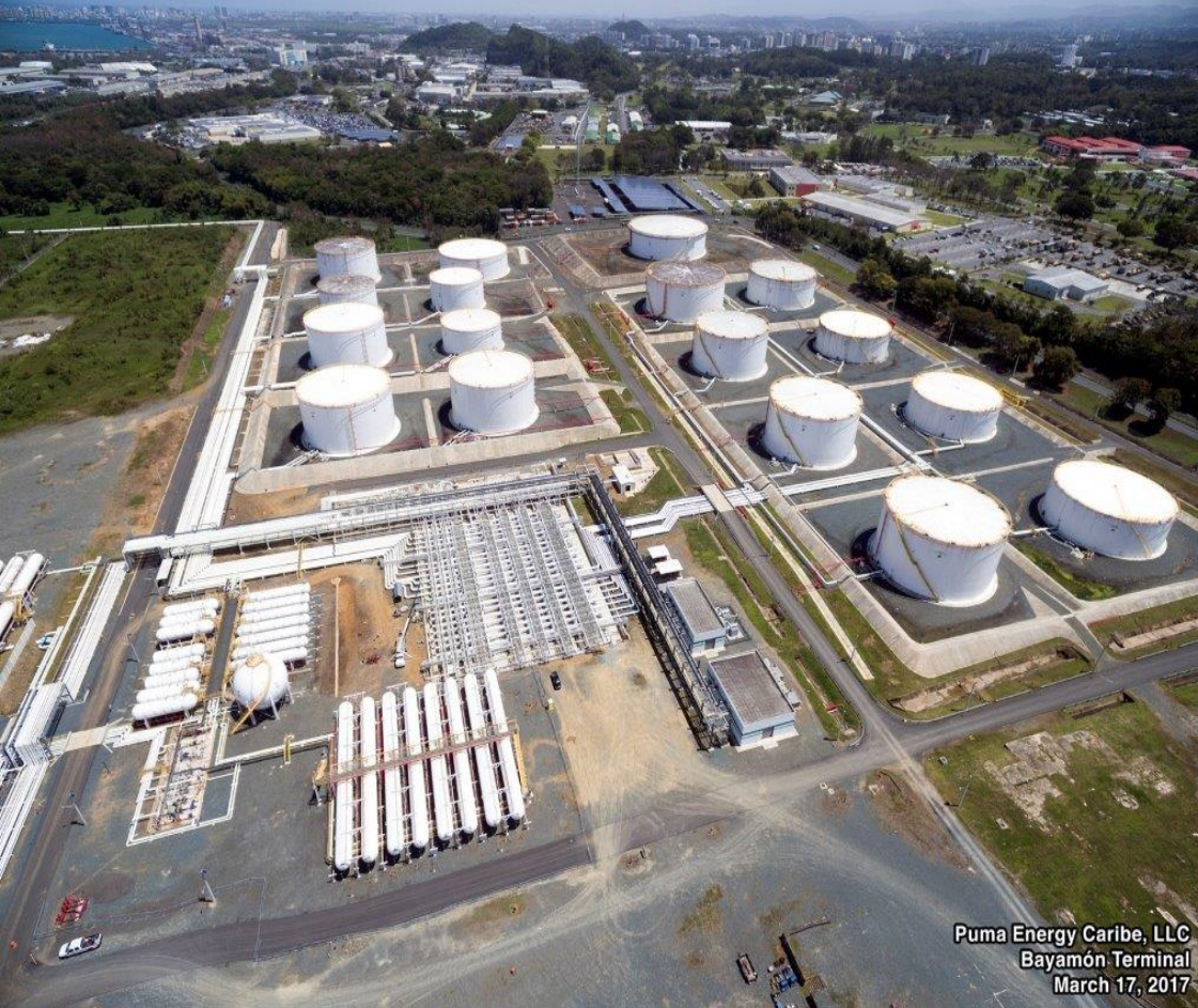
Puma Energy Caribe, LLC Bayamón Terminal March 17, 2017