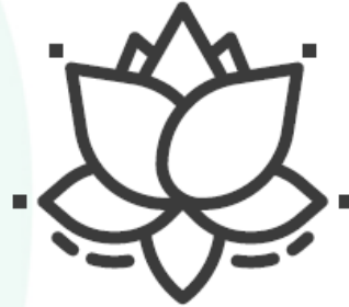
Common wellness areas