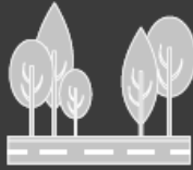
Walking trails with exercise stations