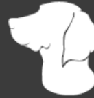
Pet exercise park