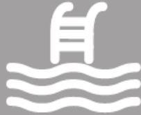
Pool for aqua-gym classes