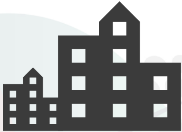
PHASE 1 - 208 apartments