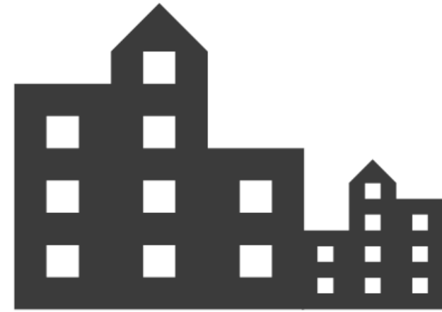
Phase 2- 140 apartments