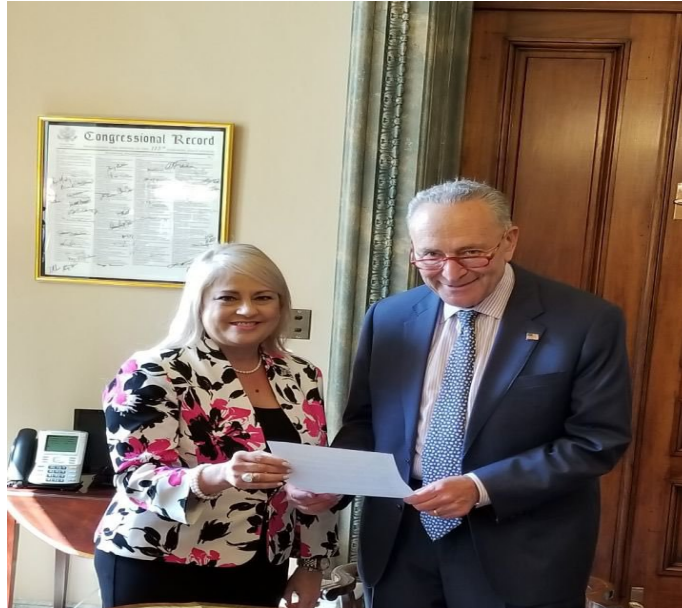
Gov. Vázquez and Leader Schumer