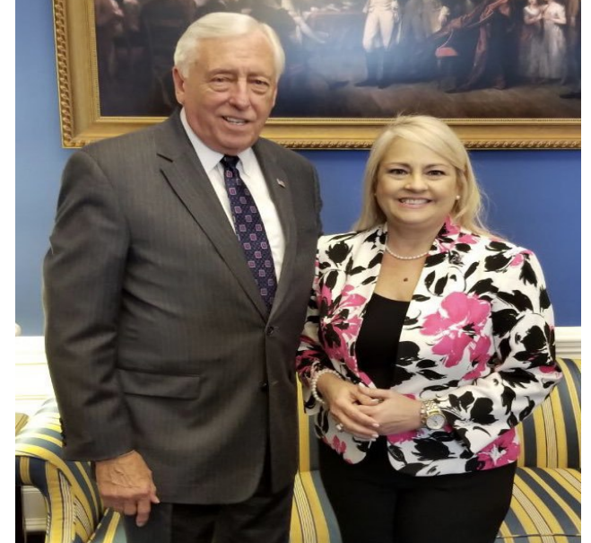
Gov. Vázquez and Majority Leader Hoyer