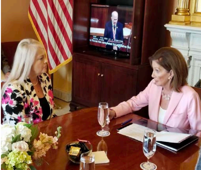
Gov. Vázquez and Speaker Pelosi