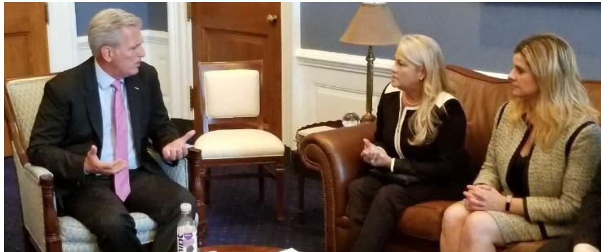
Gov. Vázquez and Leader McCarthy